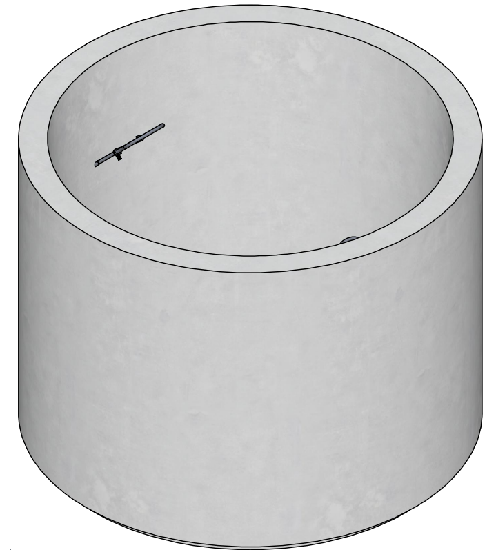
ISOMETRIC VIEW 7/8"=1'