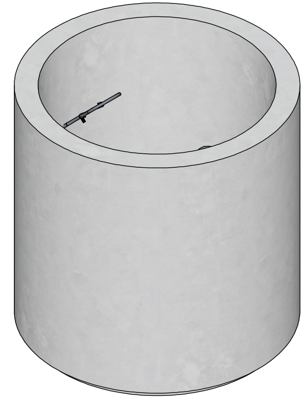
ISOMETRIC VIEW 1"=1'