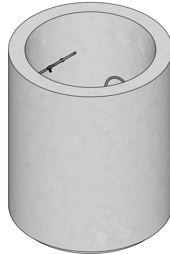
ISOMETRIC VIEW 1 1/8"=1'